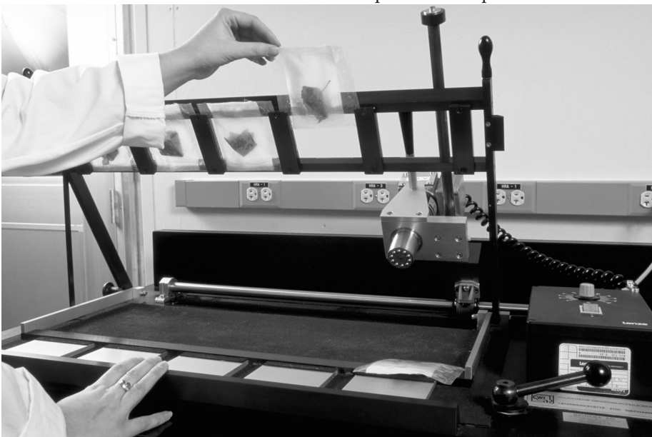
To prepare a grapevine sample for testing, sample material and buffer solution are sealed in plastic bags and loaded onto a rack that holds them in place for grinding.

Contamination is of particular concern with PCR because of the sensitivity of the test. Just a few bacteria or virus particles carried over from one sample to another could lead to false